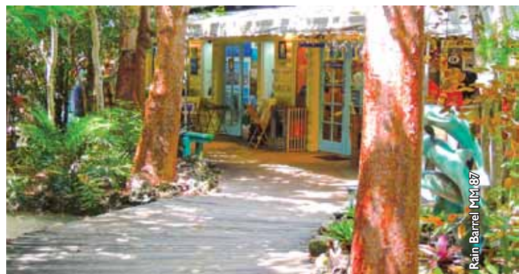
Rain Barrel MM 87